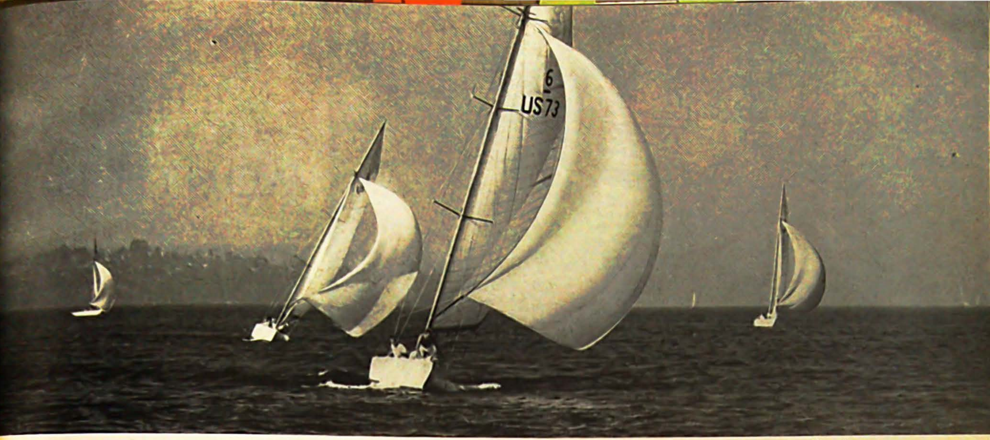
The Murray brothers' Six Meter "Saga" won the Sir Thomas Lipton Trophy in competition against an 11-boat U.S.-Canadian fleet